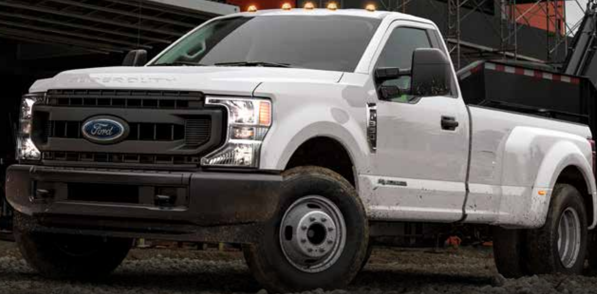
F-350 XL Regular Cab 4x2 with 6.7L V8 Turbo Diesel in Oxford White 2021 model shown

Horsepower and torque are independent attributes and may not be achieved simultaneously.