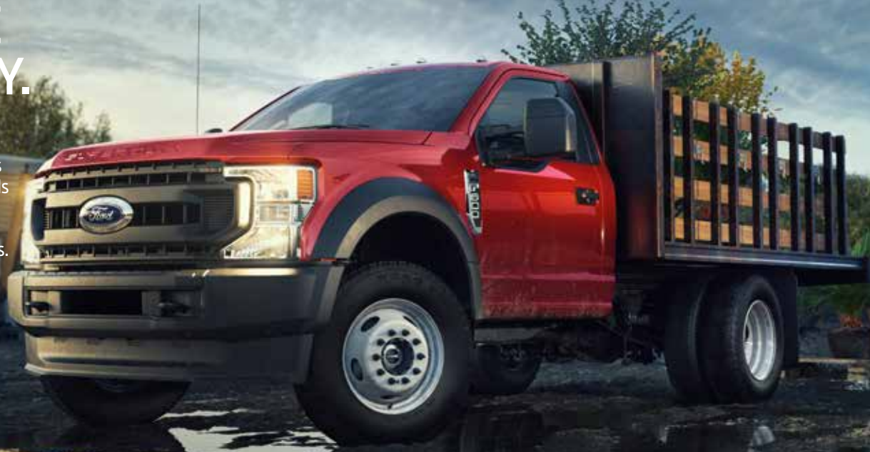
F-600 XL Regular Cab in Race Red

The 2022 Super Duty Chassis Cab models reinforce the long tradition of F-Series toughness and continue to meet the needs of a multitude of commercial applications, as well as personal use towing customers. Powerful engines, a heavy-duty 10-speed automatic transmission and available driver-assist technologies make F-350/F-450/F-550 and the F-600 Super Duty Chassis Cabs the smart choice. They are always ready to handle the hardest of towing jobs, aggressive payloads and are designed to conquer even the most challenging jobs.